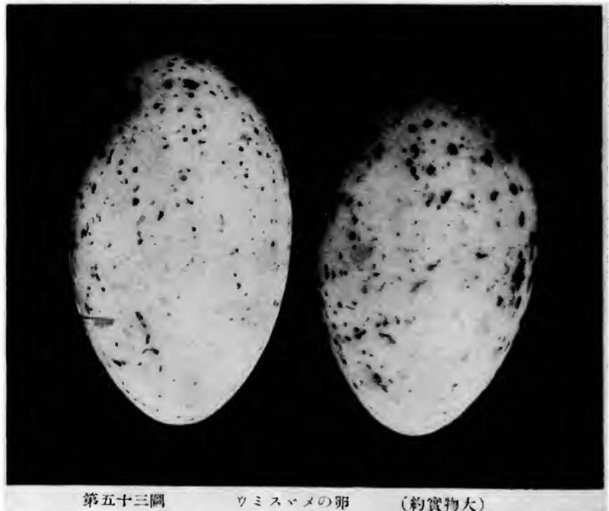
第五十三圖 ヲミスバメの卵 (約實物大)